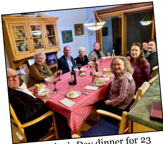
Valentine's Day dinner for 23