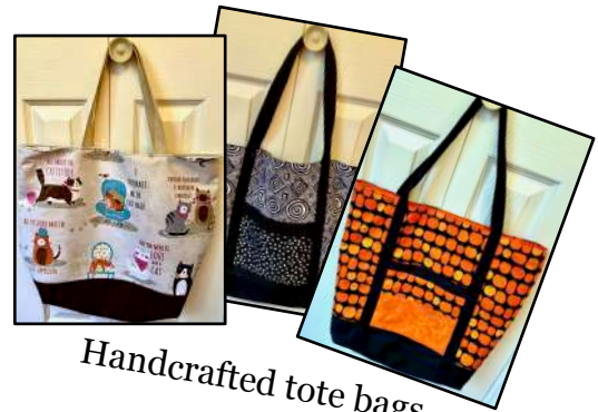
Handcrafted tote bags