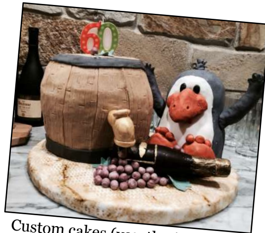
Custom cakes (yes, that's a cake!)

... as well as Christmas ornament-making classes, holiday package-wrapping services, a See's Candies sale, and more.